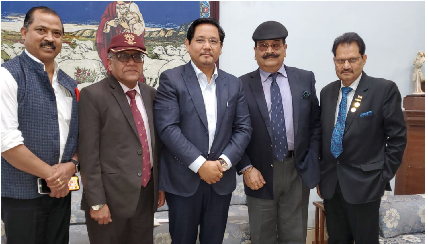
Shri. Conrad K. Sangma, Hon'ble Chief Minister Meghalaya and Shri. Vincent H. Pala, MP Meghalaya lends support to the "North East Security and Global Employability Conclave".

CAPSI delegates met the CM to appraise him of the opportunities that exist to employ the youth from Meghalaya in the Private Security Industry not only within the country but also in other friendly foreign countries. In this context, CAPSI's proposal to hold the "North East Security and Global Employability Conclave" in September in Guwahati was explained to him in great details. The idea of getting an opportunity to explore the possibilities of placing the youth from his state appealed to the Hon'ble CM who readily agreed to participate in the said event.